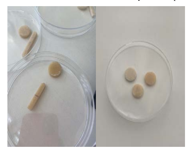
Fig. 2 – Material samples, in the shape of discs and bars.