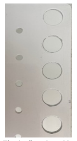
Fig. 1 – Sample molds.

A total of 120 samples were prepared, comprising 20 discs and 20 bars for each of the three dental materials used: resin-modified (RM) glass ionomer cement (GIC) (Fuji II LC<sup>®</sup>, GC Corporation Tokyo Japan), high-viscosity (HV) GIC (FUJI IX GP<sup>®</sup>, GC Corporation Tokyo Japan), and micro-hybrid composite (MHCOMP) Te-Econom Plus<sup>®</sup> (Ivoclar Vivadent, Schaan, Liechtenstein). To prevent the materials from sticking and ensure easy removal from the mold, the walls of the molds were coated with a layer of soft paraffin.