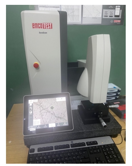
Fig. 3 – Vickers microhardness device.