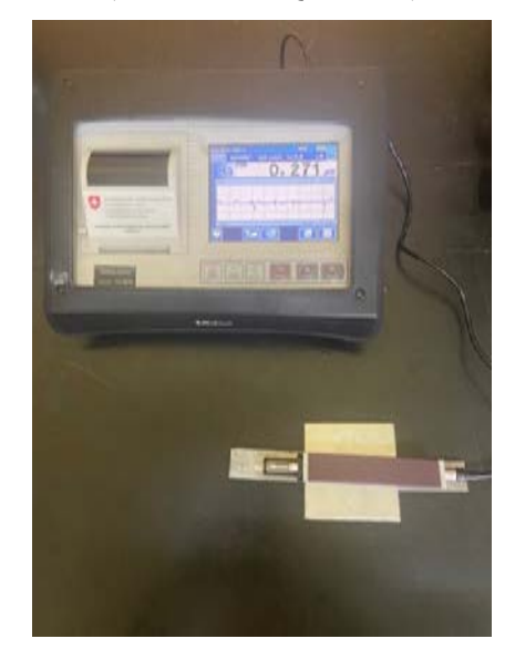
Fig. 4 – Mitutoyo SJ-310 profilometer. Lovrić J, et al. Vojnosanit Pregl 2023; 80(12): 1022–1027.